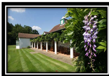
Woking GC 2021