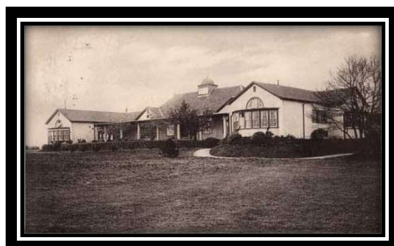
Woking G.C. (Founded 1893)