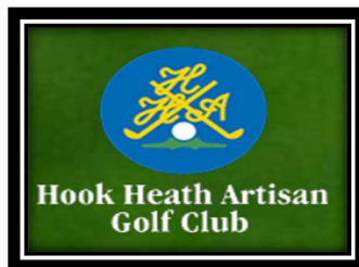
Hook Heath Artisans (1924)