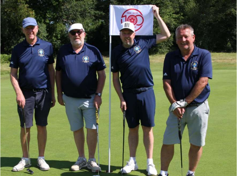
Hook Heath Team

Hook Heath Artisans represented the AGA at the England Golf Centenary celebrations during their Festival Week.