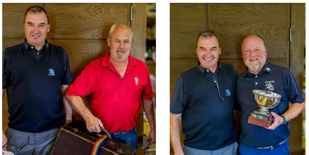
The Winners of the Seniors and Challenge Cup

Bramley Golf Club again host the Challenge Cup and Seniors Trophy on Thursday 13 June.